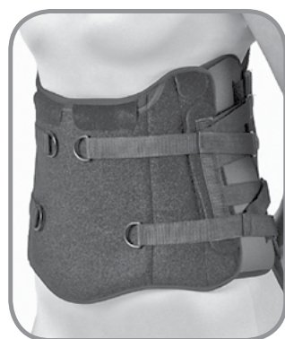
Basic Modular Spinal Orthosis