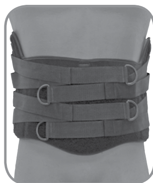
Low-Cut Anterior Panel