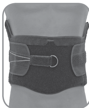
Low-Cut Shown with One-Pull Closure